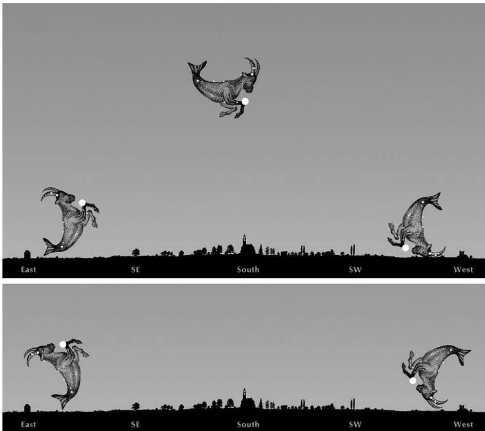
Picture 3ab: Night of 27 to 28 July: course of Capricorn and Mars across the sky 3a: Nairobi, 3b: Cape Town

completely differently. The further south we are, the earlier the July sun sets and the earlier Capricorn and Mars rise. And the closer we are to the equator, the less time dusk lasts. As darkness falls, the appearance of Mars is more quickly transformed from a dot of light in the blue sky into the great and mighty ruler of the starry world. Capricorn and Mars rise earlier and ascend at a steeper angle, faster and for longer than in northern regions. They shine at a much higher elevation at midnight. As Capricorn rises, the horns are the first thing that becomes visible and as it sets, the fishtail is the last thing to